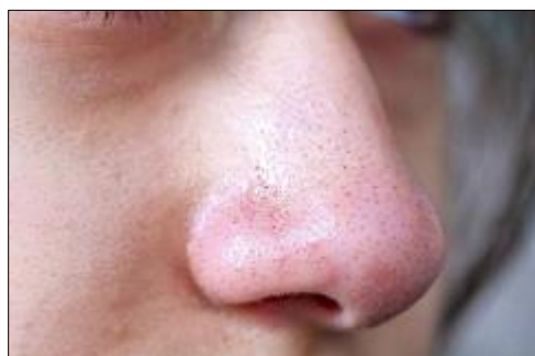
Figure 1 Blackheads