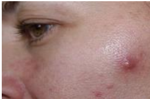
Figure 6 Etiology