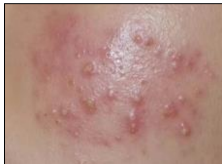
Figure 4 Pustules