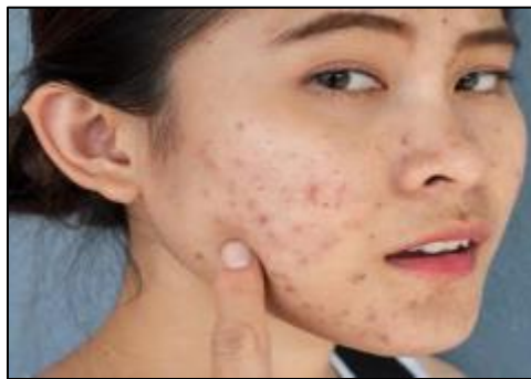
Figure 3 Papules