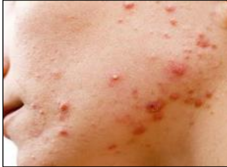
Figure 5 Nodules

the infection spreads beneath the skin's surface and affects the pores, the surrounding area may also become swollen and red, giving the appearance of a little bump. Over-the-counter drugs alone cannot treat acne nodules, which can persist for weeks or months. Nodular acne resembles papule acne, but it is larger than 5 to 10 mm in diameter and usually appears on the chin or jawline of the face.