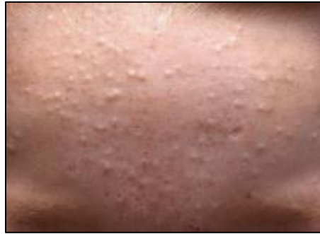
Figure 2 Whiteheads

comedones because they are white and closed pimples. Although they can appear anywhere on the body, whiteheads are most common in the T-zone, which is the area that comprises the forehead, chin, and nose. on the face, arms, shoulders, neck, chest, and back.