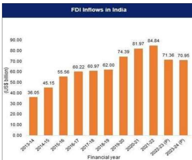
Source: foreign direct investment India Budget