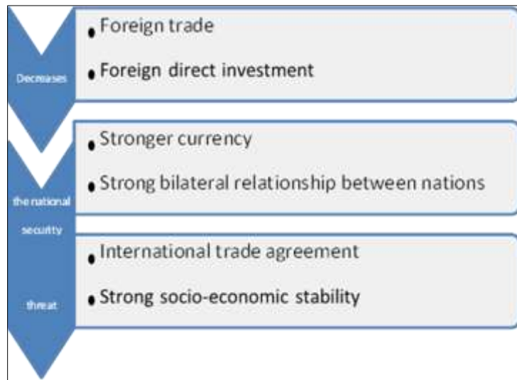
Figure 2 Conceptual framework of Factor which decreases the national security threat