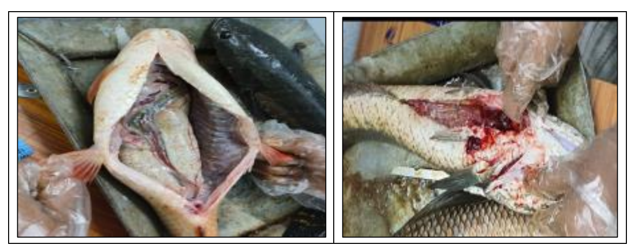
Figure 1 Observation of phytoplanton & zooplankton from digestive extract from both the species

Comparative anatomy of Labeo rohita and Channa striata reveals significant differences that reflect their distinct ecological niches. Feeding behaviors and evolutionary adaptations. Below is a detailed comparison of their anatomical features. The anatomical differences between Labeo rohita is adapted to herbivorous lifestyle and Channa striata is adpated to carnivorous lifestyle. With the anatomical features that enhance its swimming efficiency and plant-based diet. In contrast, Channa striata is a highly specialized predator with anatomical adaptation.