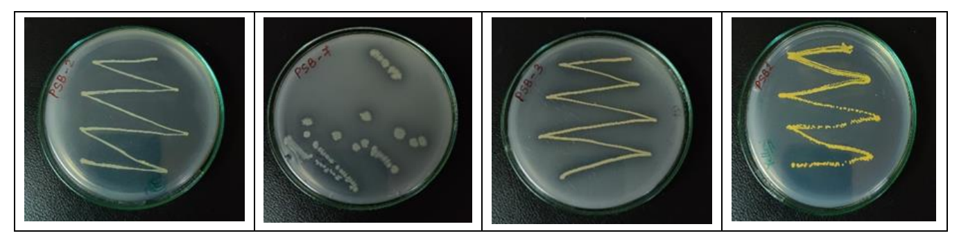
Figure 2 Pure culture of selected bacteria strains (PSB2, PSB7, PSB3, PSB1 respectively) showing growth with halo zone on selective media

Most colonies had a clear opacity, resulting in milky, white, or yellow tint on the agar plates. The bacterial colonies had round to irregular forms with elevated elevations. Of the ten PSB isolates, eight were gram-negative and two were gram positive. The results of different biochemical tests for four PSB isolates with comparatively higher phosphate solubilizing index were summarized in figure 1.