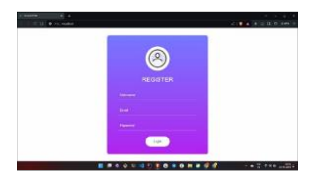
Figure 1 Registration interface

The results of executing the created framework are apparent in the taking after interfacing, starting with the beginning enlistment and login page. The fundamental center is on sending counseling messages, which can incorporate pictures. At last, the interfacing will show the comes about of encryption, appearing the scrambled record information and the encryption values of the information.