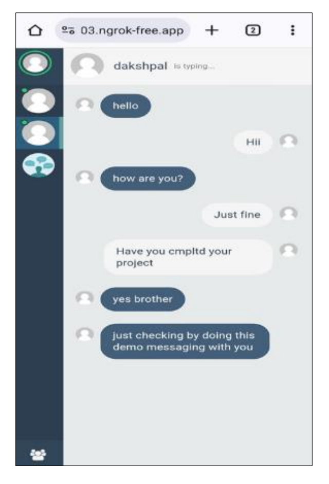
Figure 4 Sender side chat room interface