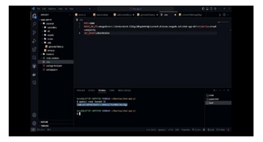
Figure 5 Encryption result

From the comes about of sending messages containing pictures, the framework naturally performs the encryption and unscrambling forms. This operation produces encryption information, which is at that point put away in the Firebase database. The points of interest of the encryption information are as takes after.