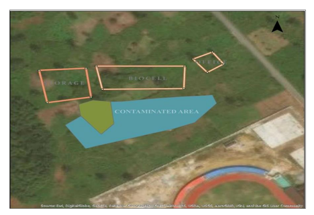
Figure 2 Conceptual Site Layout

The contaminated area was divided into two parts Section I and II. The site was arranged in such a way that one part of the contaminated site was first excavated, treated and backfilled before proceeding to the second part.