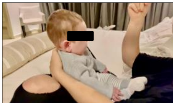
Figure 4 After treatment