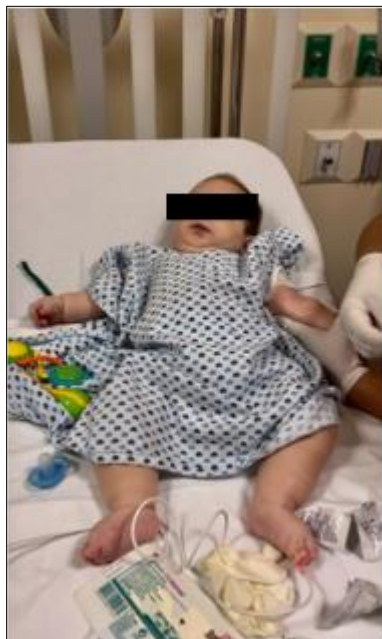
Figure 3 Before treatment

The Chop Intend scale was 42 after treatment with improvement (Fig. 4).