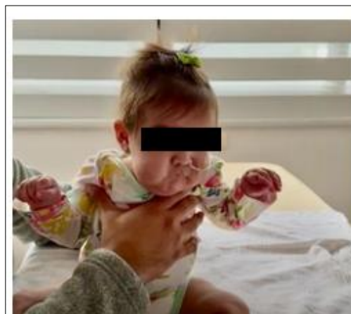
Figure 2 After treatment