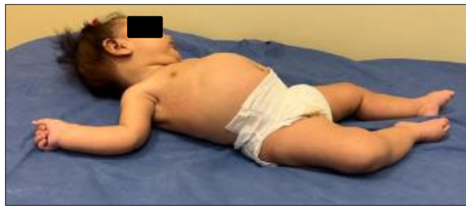
Figure 1 Before treatment

The Chop Intend Scale was 45 after treatment with improvement (Fig. 2).